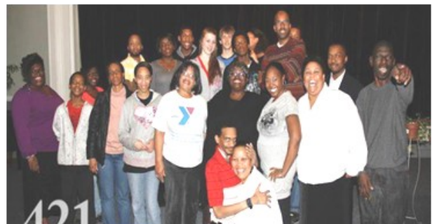
Members of the RAGS Productions team

RAGS Productions is by far a valuable CSI partner that is making a tremendous positive difference in our community.